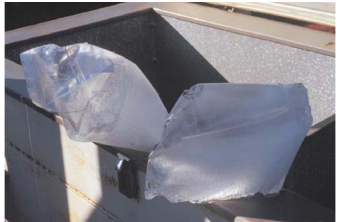
Above: About ten pounds of ice are created in one cycle of ammonia evaporation / condensation.

As the generator cools, the night cycle begins. The calcium chloride reabsorbs ammonia gas, pulling it back through the condenser coil as it evaporates out of the tank in the insulated box. The evaporation of the ammonia removes large quantities of heat from the collector tank and the water surrounding it. How much heat a given refrigerant will absorb depends on its "heat of vaporization," — the amount of energy required to evaporate a certain amount of that refrigerant. Few