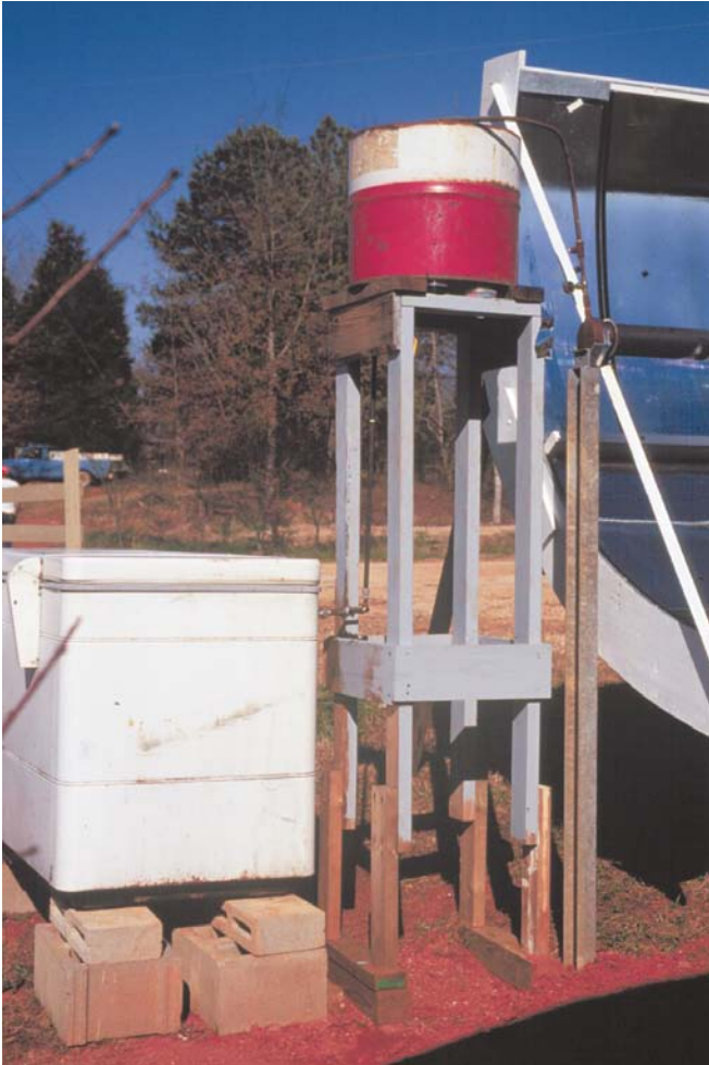
Above: Detail of the condenser bath, containing the condenser coil, and the icemaker box below.

The generator is a three-inch non-galvanized steel pipe positioned at the focus of a parabolic trough collector. The generator is oriented east-west, so that only seasonal and not daily tracking of the collector is required. During construction, calcium chloride is placed in the generator, which is then capped closed. Pure (anhydrous) ammonia obtained in a pressurized tank is allowed to evaporate through a valve into the generator and is absorbed by the salt molecules, forming a calcium chloride-ammonia solution ( \text{CaCl}_2 \cdot 8\text{NH}_3 ).