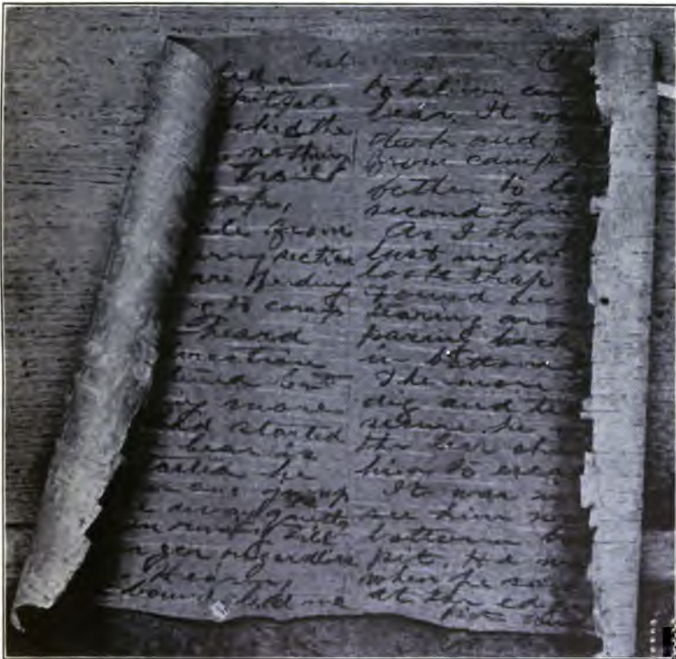
A BIRCH-BARK MESSAGE TO THE OUTSIDE WORLD, WRITTEN BY THE AUTHOR IN THE WOODS WITH BURNT STICKS FROM HIS FIRES