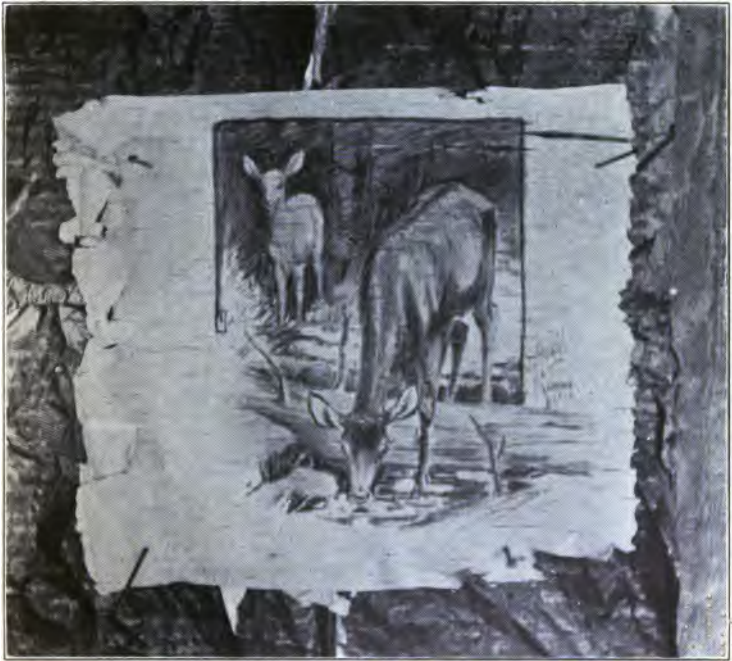
THE DEER AND THE WHITE FAWN. A SKETCH MADE IN THE WOODS BY THE AUTHOR ON BIRCH BARK, WITH BURNT STICKS FROM HIS FIRES