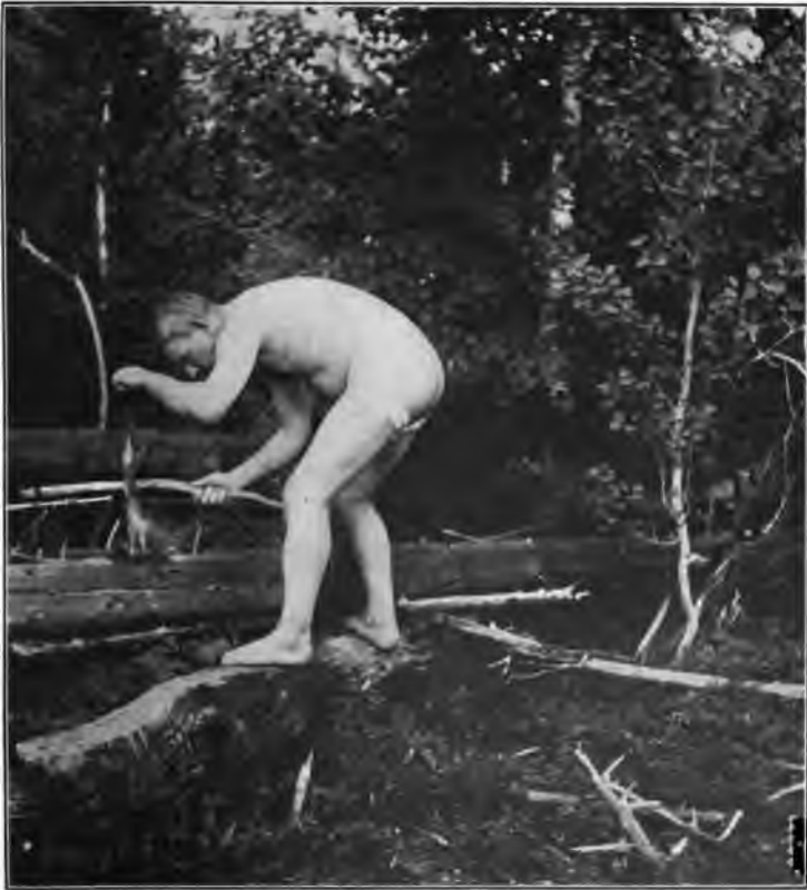
THE AUTHOR DEMONSTRATING FIRE-MAKING BY FRICTION WITH CRUDE MATERIAL. POSED SHORTLY BEFORE HE ENTERED THE WOODS