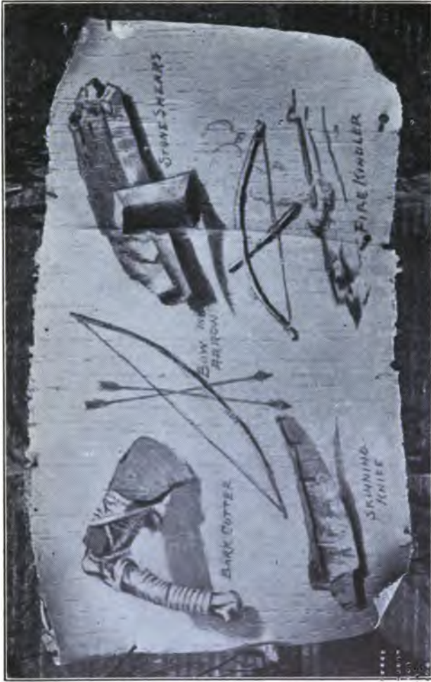
IMPLEMENTS MADE IN THE WOODS BY THE AUTHOR AND USED BY HIM DURING HIS EXPERIMENT. A SKETCH MADE BY THE AUTHOR IN THE WOODS ON BIRCH BARK, WITH BURNT STICKS FROM HIS FIRES