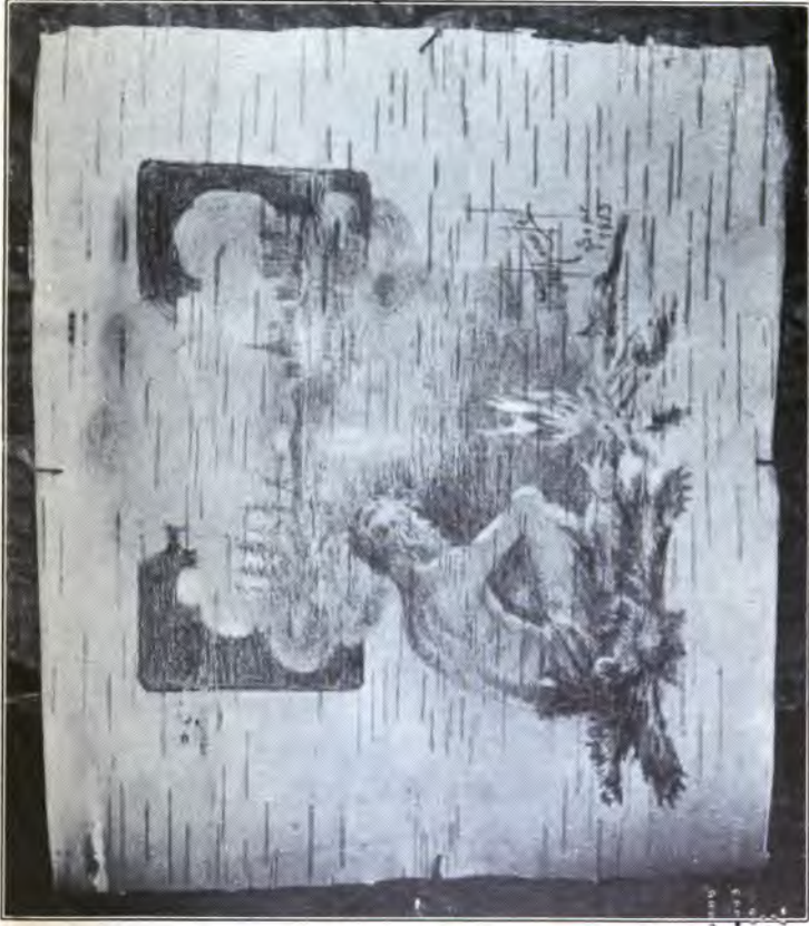
DREAM PICTURE OF THE OUTSIDE WORLD. DRAWN IN THE WOODS BY THE AUTHOR ON BIRCH BARK, WITH BURNT STICKS FROM HIS FIRES