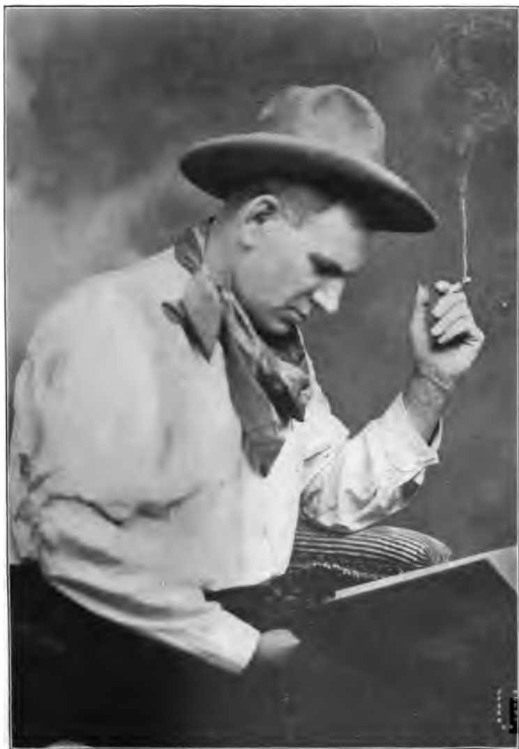
JOSEPH KNOWLES AS HE APPEARED A MONTH BEFORE ENTERING THE WOODS