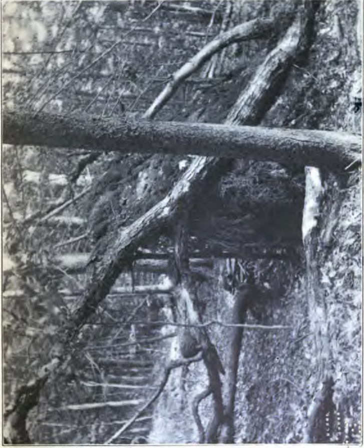
REAR VIEW OF ONE OF THE AUTHOR'S LEAN-TOS IN THE BEAR MOUNTAIN COUNTRY. FOUND AND PHOTOGRAPHED BY OUTSIDERS AFTER THE AUTHOR HAD LEFT