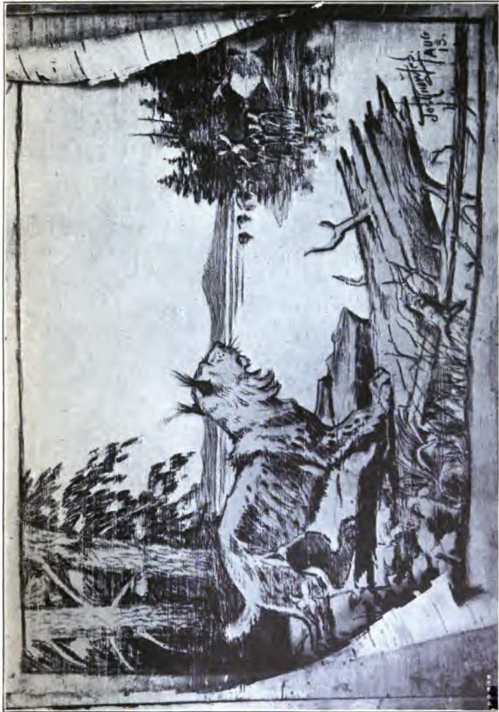
WILD-CAT WATCHING DEER AND FAWN. DRAWN BY THE AUTHOR IN THE WOODS ON BIRCH BARK, WITH BURNT STICKS FROM HIS FIRES