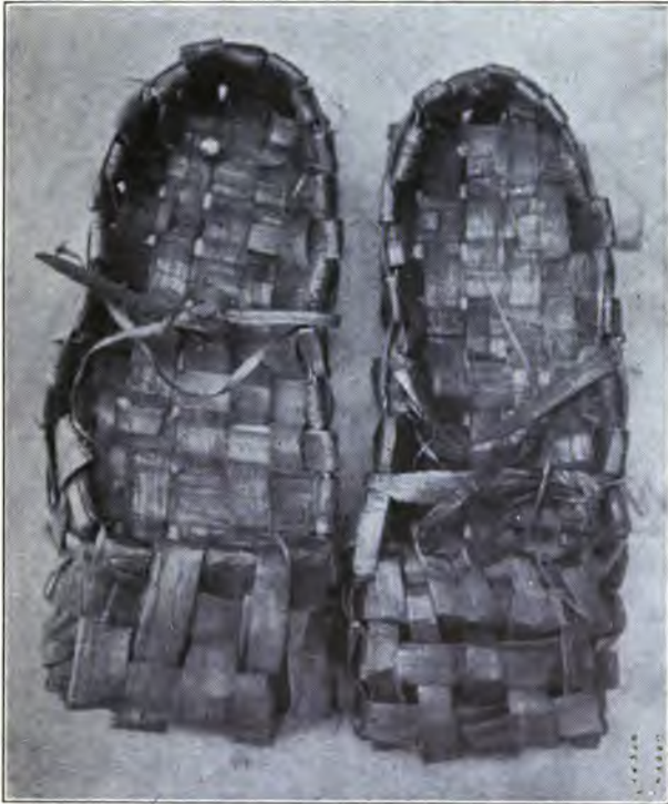
THE AUTHOR'S FIRST SHOES, MADE OF THE INNER LINING BARK OF THE CEDAR