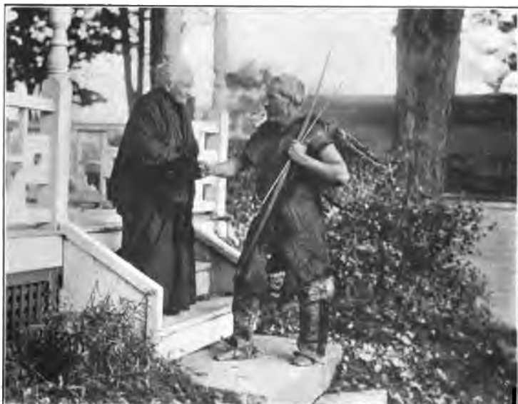
THE AUTHOR GREETING HIS MOTHER AT WILTON, MAINE, AFTER HE HAD COMPLETED HIS EXPERIMENT