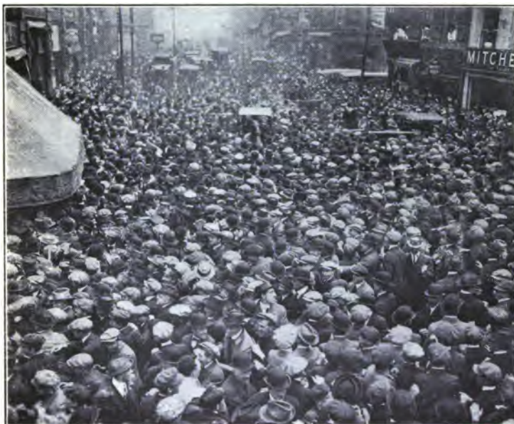
A PORTION OF THE CROWD THAT GREETED JOSEPH KNOWLES ON HIS ARRIVAL IN BOSTON, OCTOBER 9, 1913