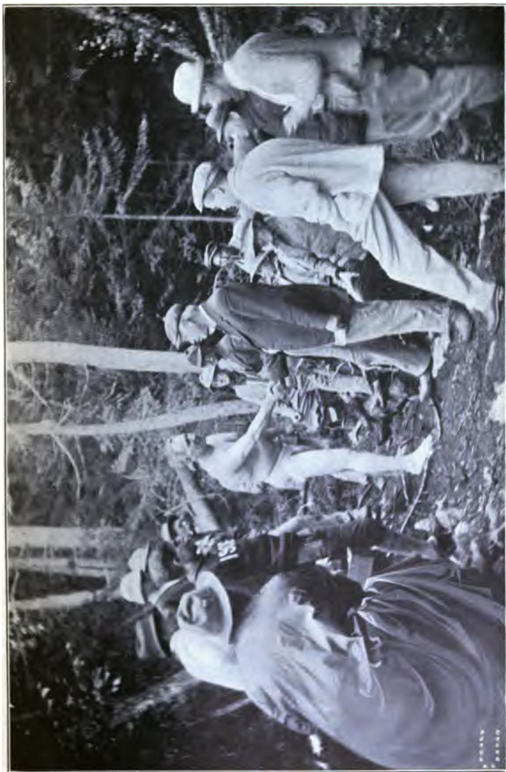
BREAKING THE LAST LINK. ENTERING THE WOODS AT THE FOOT OF SPENCER TRAIL, AUGUST 4, 1913