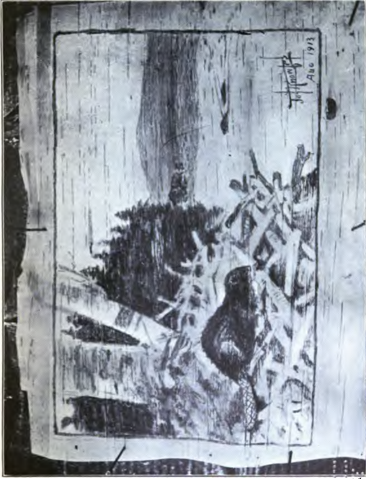
BEAVER AT WORK. DRAWN BY THE AUTHOR IN THE WOODS ON BIRCH BARK, WITH BURNT STICKS FROM HIS FIRES

4 5 6 7 8 9 10 11 12 13 14 15 16 17 18 19 20 21 22 23 24 25 26 27 28 29 30 31 32 33 34 35 36 37 38 39 40 41 42 43 44 45 46 47 48 49 50 51 52 53 54 55 56 57 58 59 60 61 62 63 64 65 66 67 68 69 70 71 72 73 74 75 76 77 78 79 80 81 82 83 84 85 86 87 88 89 90 91 92 93 94 95 96 97 98 99 100