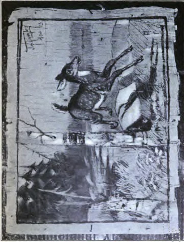
THE LITTLE FAWN. DRAWN BY THE AUTHOR IN THE WOODS ON BIRCH BARK, WITH BURNT STICKS FROM HIS FIRES