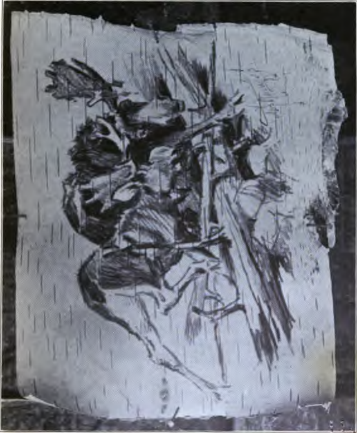
THE BATTLE OF THE MOOSE. SKETCH MADE BY THE AUTHOR IN THE WOODS ON BIRCH BARK, WITH BURNT STICKS FROM HIS FIRES