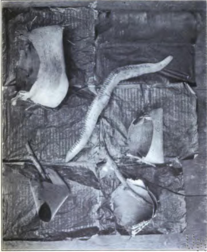
CALENDAR (IN CENTER), BIRCH-BARK DISHES AND DRINKING CUPS, FOUND IN THE WOODS AFTER THE AUTHOR HAD LEFT. THE CALENDAR HE LOST SEVERAL DAYS BEFORE HE LEFT FOR CANADA, BUT IT WAS FOUND BY OTHERS AFTERWARD