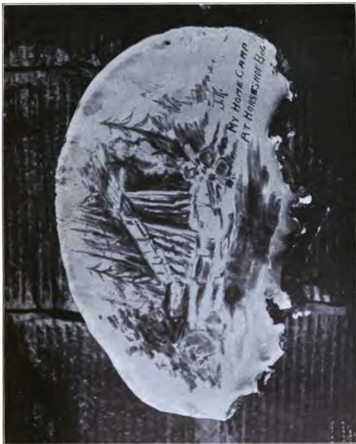
..... A SKETCH DONE BY THE AUTHOR IN THE WOODS ON A PIECE OF FUNGUS, WITH BURNT STICKS FROM HIS FIRES