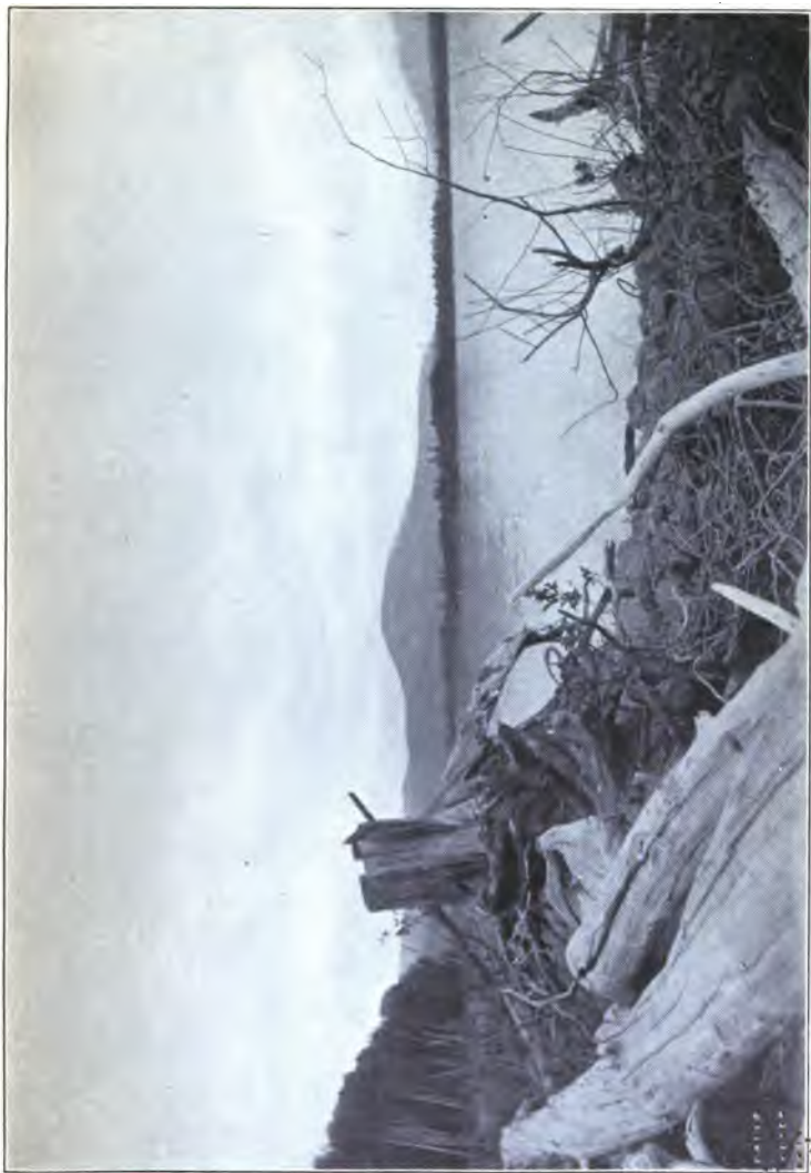
..... A GLIMPSE OF THE SPENCER COUNTRY IN NORTHERN MAINE