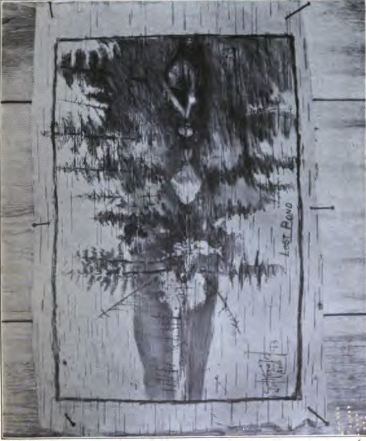
THE DOE AT LOST POND. THE FIRST SKETCH DRAWN BY THE AUTHOR DURING HIS TWO MONTHS IN THE WILDERNESS. DONE ON BIRCH BARK WITH BURNT STICKS FROM HIS FIRES