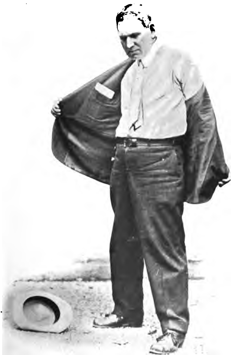
PREPARING TO ENTER THE WILDERNESS